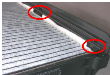
Previous MANN-FILTER design in the housing