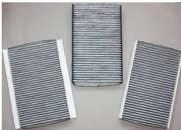
New Design MANN-FILTER CUK 2940

The new material of the frame at the longitudinal side still cares for an optimal sealing in the filter seat. This is whereby the original press cuts and the V-flap can be removed.