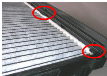
New MANN-FILTER design in the housing